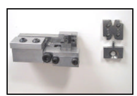
Die set: DF13-TB2630HC/US-DS

Please note: Due to the small size of the DF13 contacts, the DF13 die set has a carrier strip feeder in addition to the anvil and crimp dies. Carrier strip feeder is only available for the DF13 contacts.